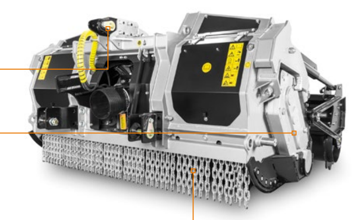
System protection chains the chains are fixed on plate and these plates screwed to the frame