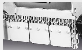
Bolt-on chain's protection plates