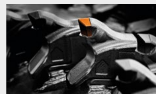
Multiple tooth options