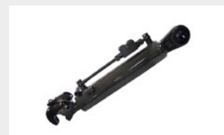
Hydraulic top link