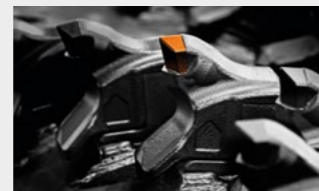
Multiple tooth options