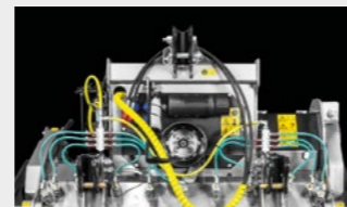
The Water Spray System (Basic & High Flow) has the dual function of cooling and mixing