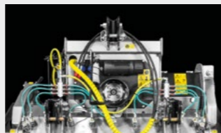
The Water Spray System (High Flow & FCS) has the dual function of cooling and mixing