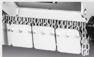
Bolt-on chain's protection plates