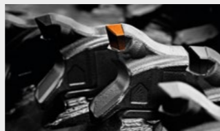
Multiple tooth options