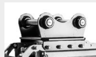
Customized attachment bracket