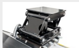
Attachment plate with self levelling device to adapt to all types of terrain