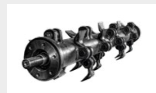
Possibility to have the rotor equipped with PML hammers or Y-flail